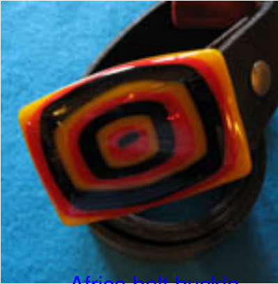
Africa belt buckle