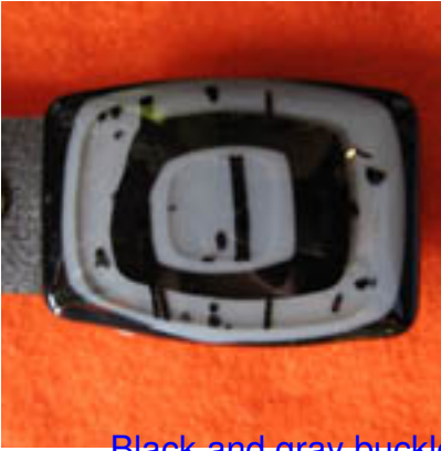
Black and gray buckle