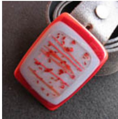
Japan belt buckle