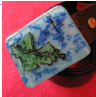
Louisiana belt buckle