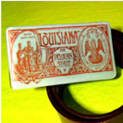
Old Louisiana flag Belt buckle

These are the Mac daddy of our glass collection these solid, smooth and crazy belt buckles defiantly demand eye popping attention, each piece created individually with wonderful color combos, fired for up to 14hours to form into these sturdy belt buckles. Every buckle has a strong nickel belt finding making it easy to place onto any clip belt. The “bad a bling “of buckles!