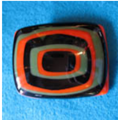
Autumn belt buckle