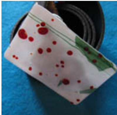
Christmas belt buckle