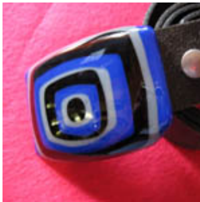
Black and blue buckle