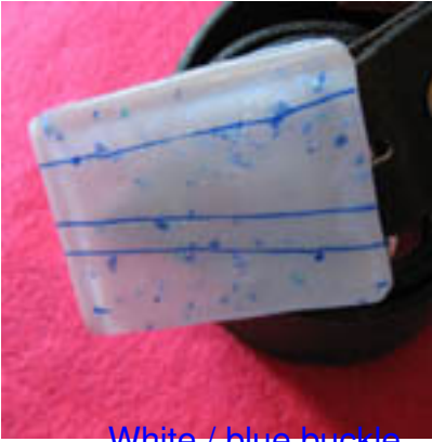
White / blue buckle