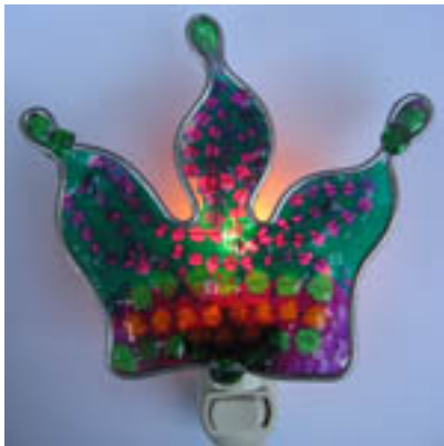
Mardi gras crown nightlight

These one of a kind nightlights are all individually handmade from “re-fused “ mardi gras beads and wire , loved by young and old alike these nightlights gives a little recycled New Orleans glow to your environment. All night lights come with a 4watt bulb and have an on/off switch made with UL issue electrical parts, Let your little light shine!