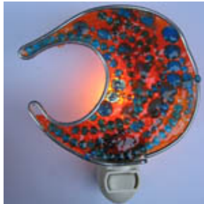
– Moon nightlight