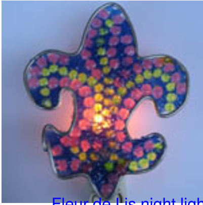
Fleur de Lis night light