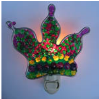
– Mardi gras crown night light