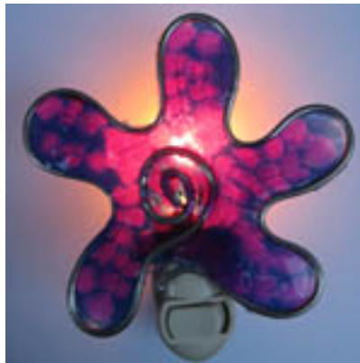
Flower night light