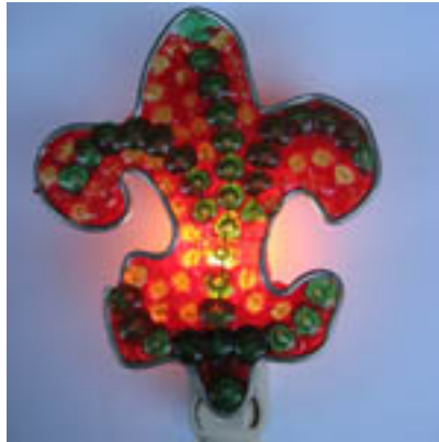
– Fleur de Lis night light