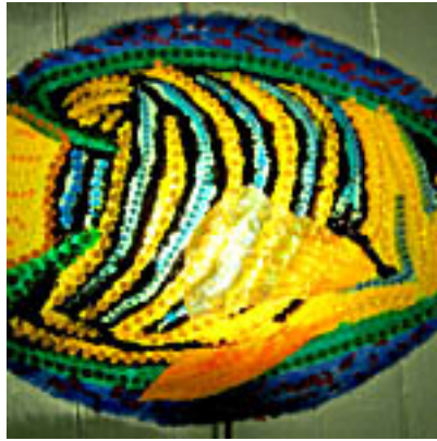
— below sea level