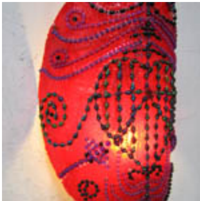
— wall —

So check out all the amazing styles and get some Mardi Gras glow into your environment.