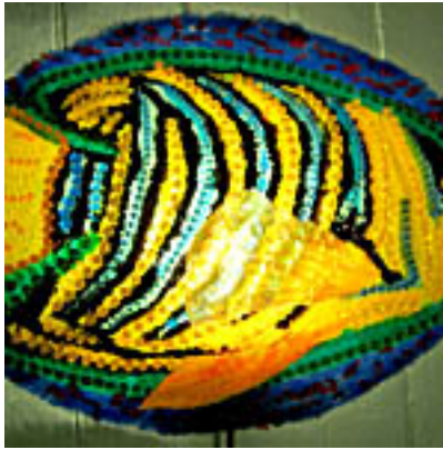
below sea level